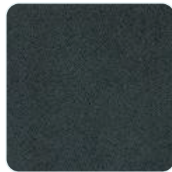
Black caviar look