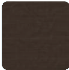
Wenge oak look